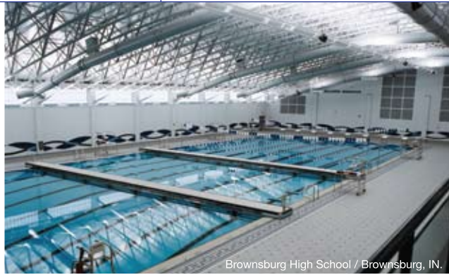
Brownsburg High School / Brownsburg, IN.