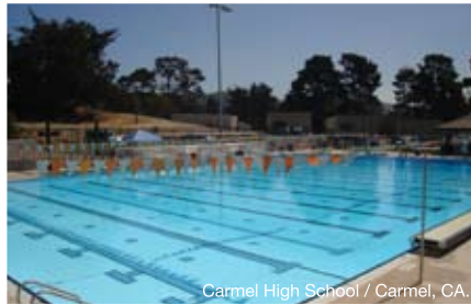
Carmel High School / Carmel, CA.