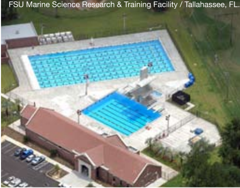
FSU Marine Science Research & Training Facility / Tallahassee, FL.