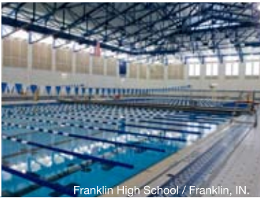
Franklin High School / Franklin, IN.